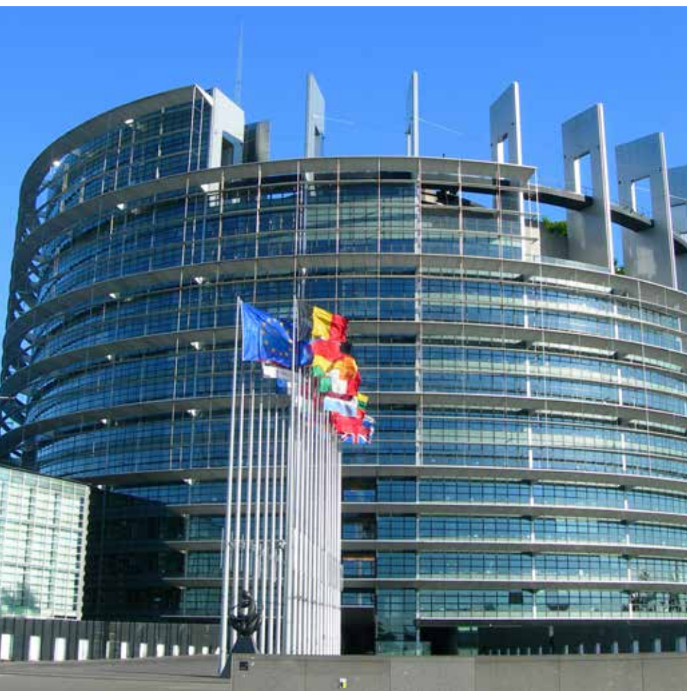
Edificio del Parlamento Europeo en Estrasburgo.